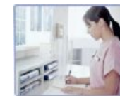
Certified Nurse Assistant