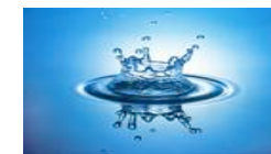
Water Treatment/Distribution/Wastewater Operator Levels 1