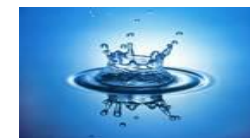
Water Treatment/Distribution/Wastewater Operator Levels 1