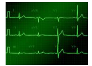
EKG/ECG/ Cardiac Technician