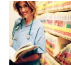
Certified Medical Assistant