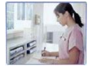
Certified Nurse Assistant